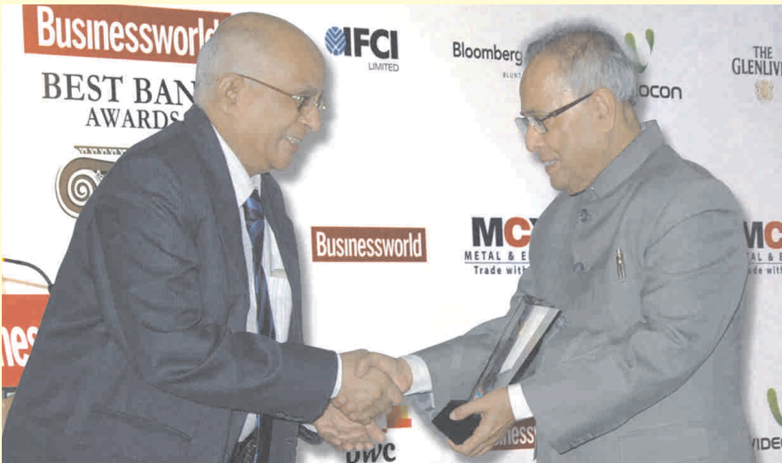
Best Small sized Bank, 2010 by Business World Price Waterhouse Coopers