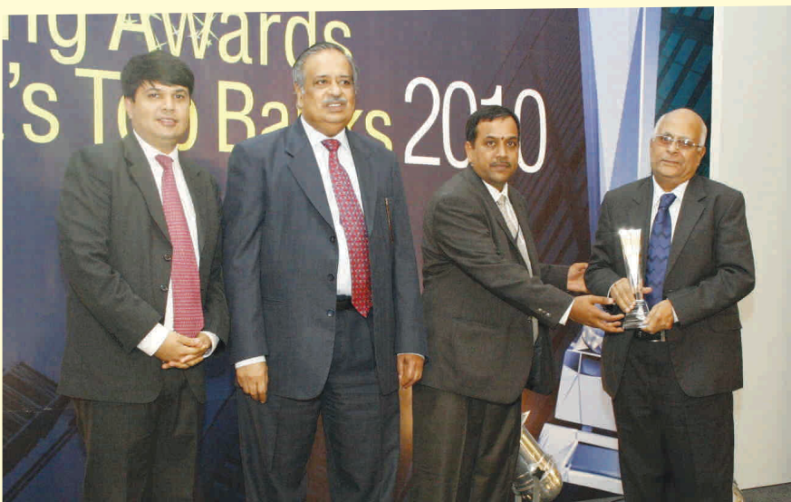
Dun & Bradstreet Banking Award 2010 for Best Private Sector Bank in "Asset Quality"