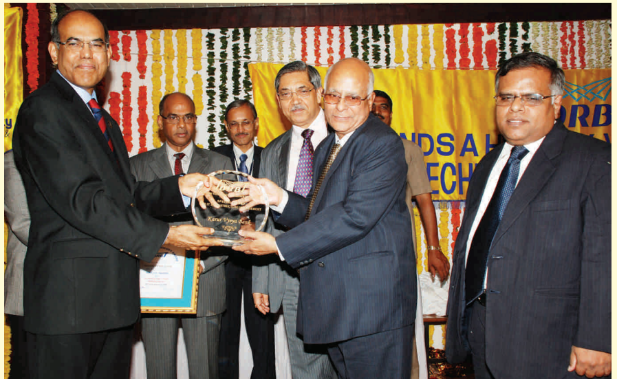
"Banking Technology Excellence Awards - 2009" For Best IT Infrastructure Management, 2009 by IDRBT, Hyderabad