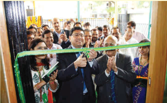
◀ BALLYGANGE - KOLKATA