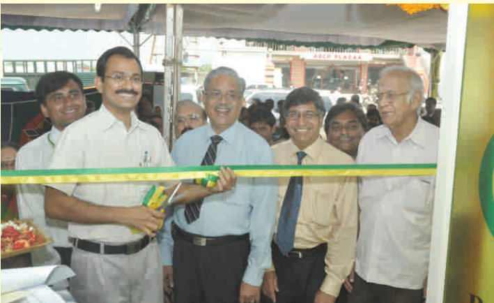
◀ PORUR - CHENNAI