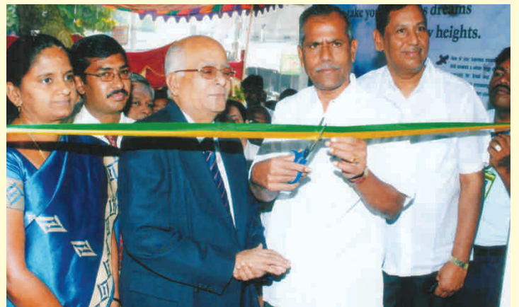
VENGAMEDU - KARUR ▶