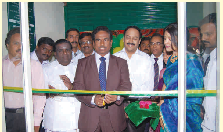
PALANGANATHAM - MADURAI ▶