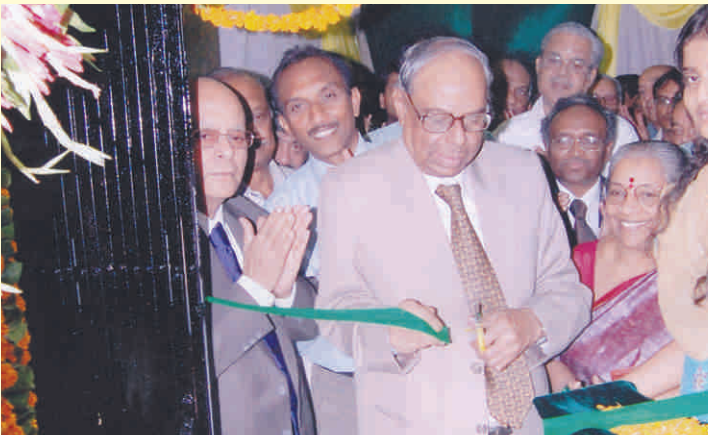
◀ CHANDINI CHOWK - DELHI