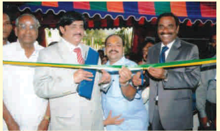
SRINIVASA NAGAR - TRICHY ▶