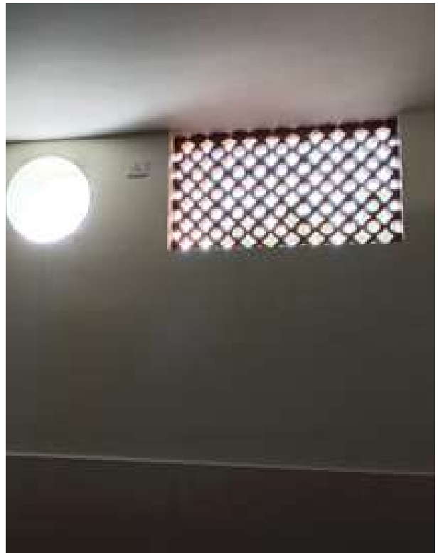
Toilets with good ventilation