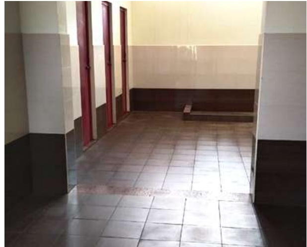
Proper floor tiles for toilets