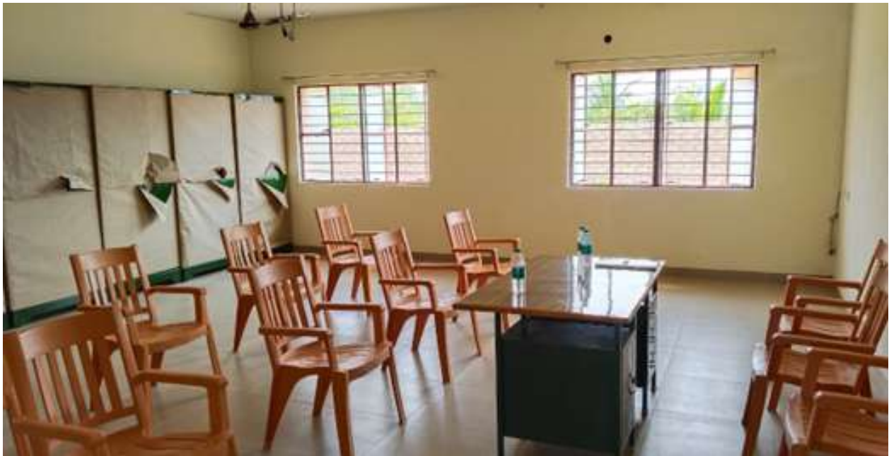
Meeting hall for staffs