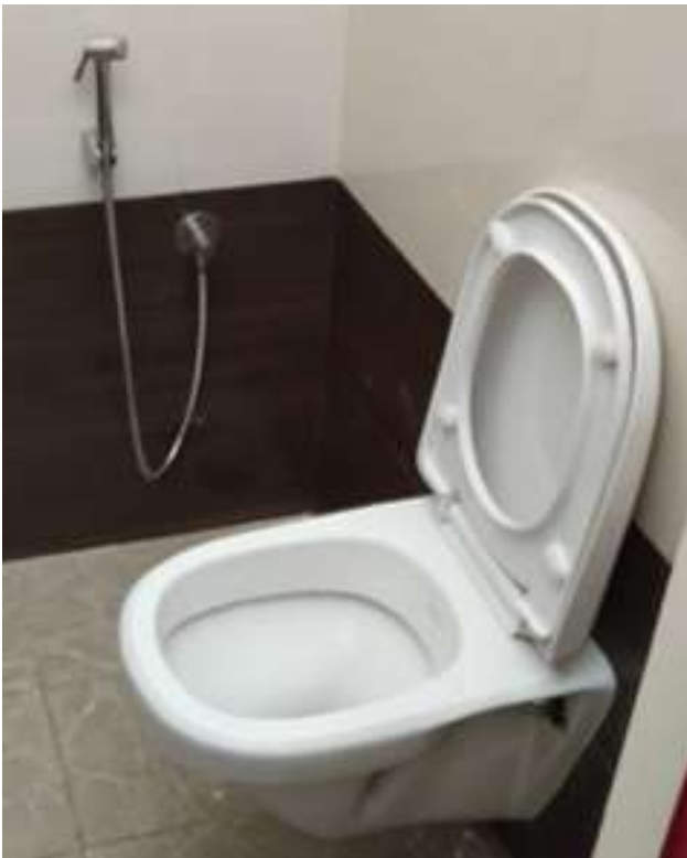
Western-type toilets for staff and differently-abled people and students