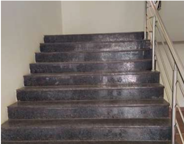
Granite stone staircase