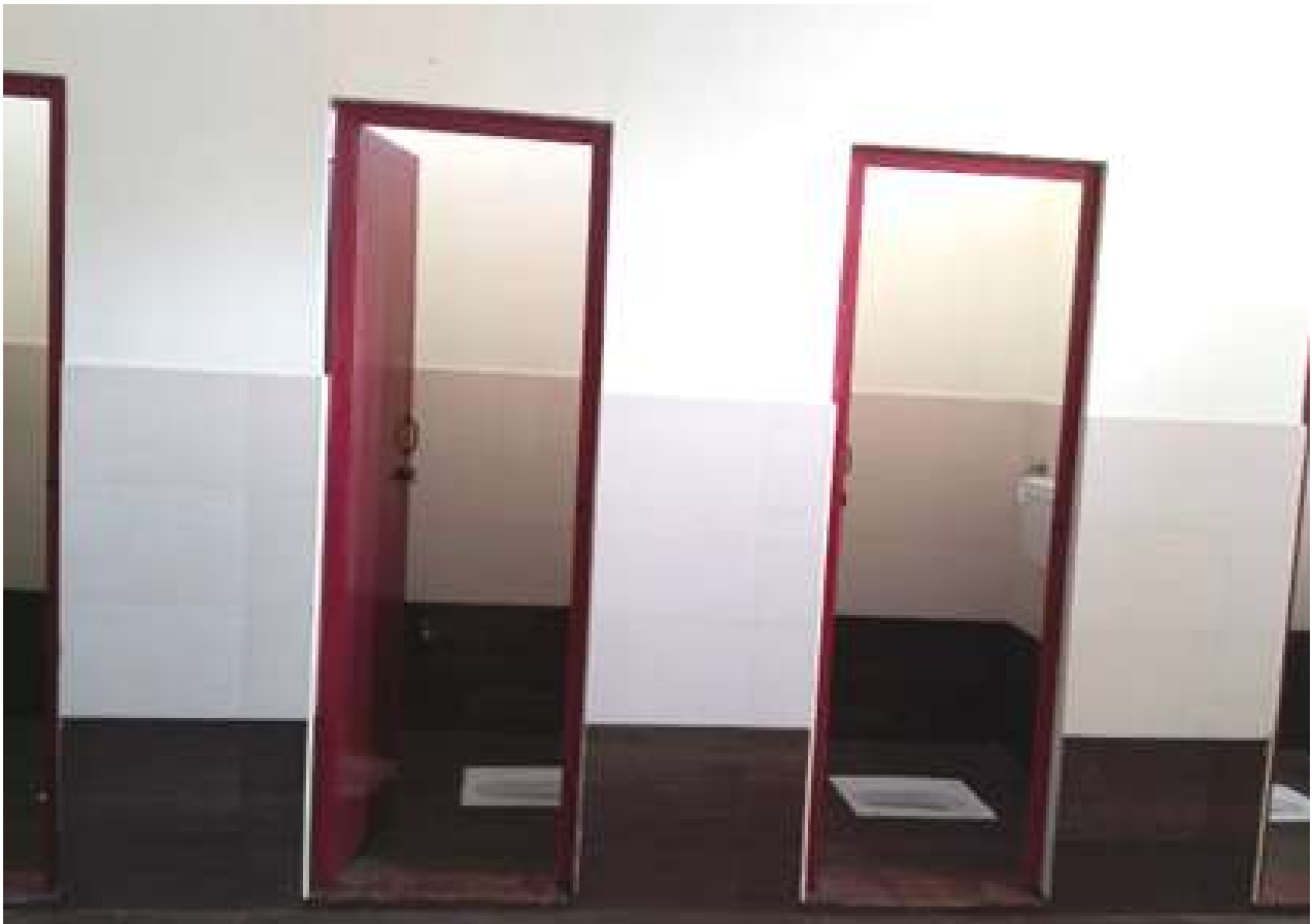
Sophisticated toilets for boys and girls