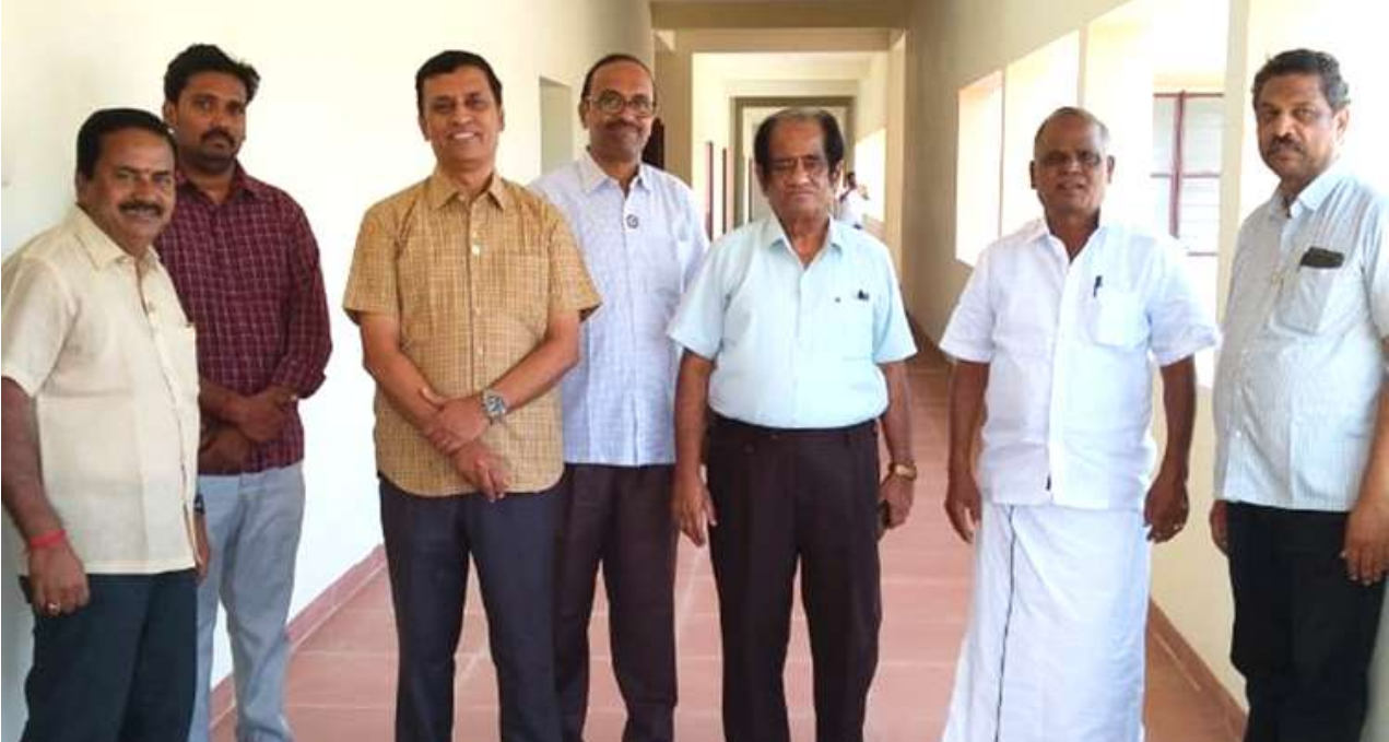
Major Stakeholders (Lions Club Members)