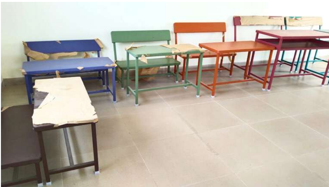
Good quality benches