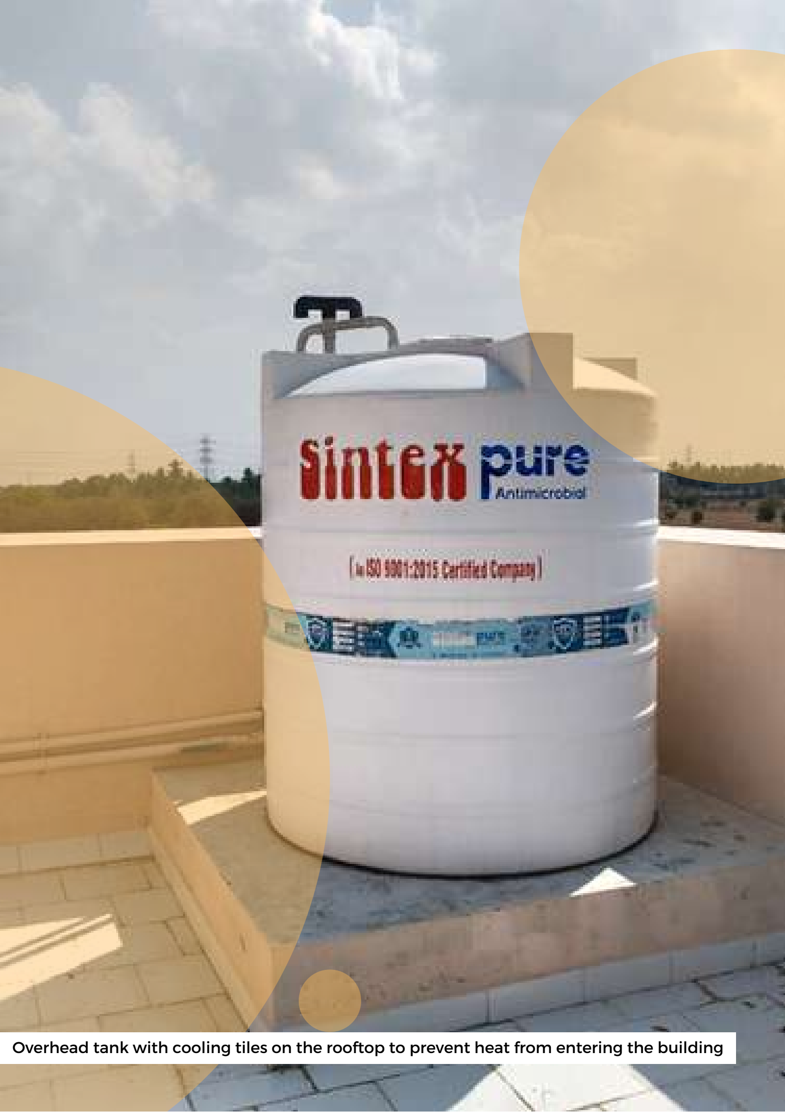
Overhead tank with cooling tiles on the rooftop to prevent heat from entering the building